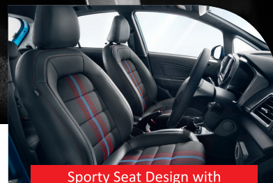
Sporty Seat Design with Semi Leather Upholstery