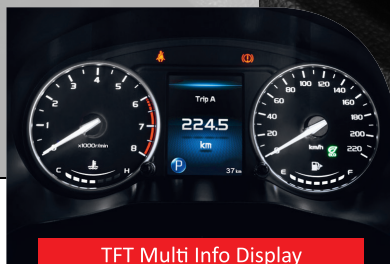
TFT Multi Info Display with ECO Drive Assist