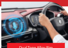
Dual Tone Alloy Rim