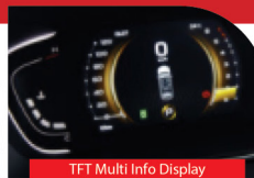
TFT Multi Info Display with ECO Drive Assist