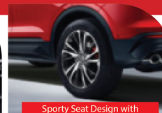
Sporty Seat Design with Semi Leather Upholstery